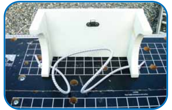
Overall view of the mount ready to install. Note the bungee cord and the hammock hook.

the flare canister, onto the hammock hook and out the hole in the other cradle. I adjusted the tension on the bungee until it was tight enough to hold the canister in place but still easy enough to pop off. After knotting the bungee cord, I put glue on the knots to keep them from coming undone.