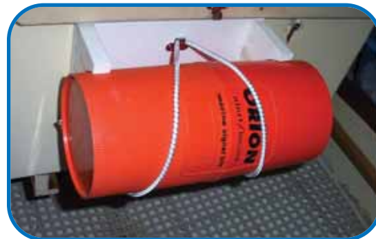
The finished mount installed below the companionway for quick access.

While the polymer lumber probably isn't cheaper than teak, I still like the clean design and the fact that I don't have to varnish and re-varnish the mount. Overall, this is a good project for a rainy weekend.