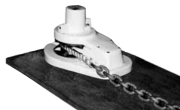
F850 Rope/Chain Series