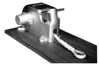
500 Rope Series