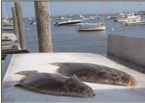
Fluke like these CT legals wouldn't be legal in Rhode Island or New York waters where minimum lengths of 19 and 19.5 inches respectively, are in place.

During July, blues are likely to show up around any rip line or beach along the entire coast. The primary fisheries take place in the deep water areas along the mouth of the Sound such as the Race and Plum Gut. Inside the Sound, many of the deep-water areas around places such as Six Mile Reef and Falkner Is-