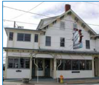
Claudio's Restaurant established in 1870

Greenport has a rich maritime history. Settled in 1640, it became a major whaling port in the early 18th century - with 24 whaling ships making a total of 103 voyages throughout