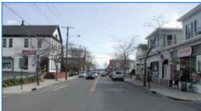
Main Street in Greenport, NY