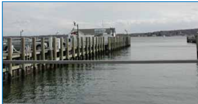
Greenport Harbor on the North Fork.

Fudge gets me thinking about children. What a paradise for families cruising with kids who ar suffering from cabin fever, not only can they ride the antique carousel from only one dollar (unless they grab the brass ring), but they can have a ride on a real miniature