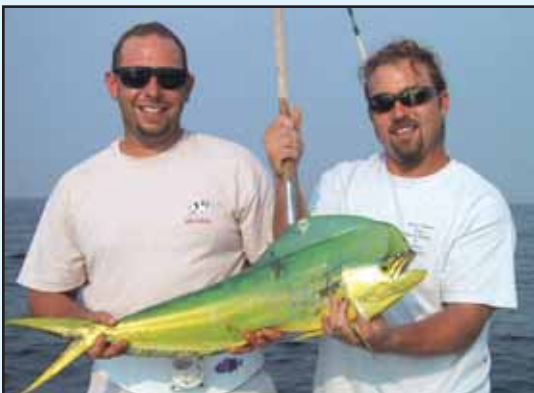
A bull dolphin still on the gaff, Sea Hunt Charters, Point Lookout.

Crabs will be just right now so make sure you have some pots with bunker going at the dock. Pots now come in 1/4, 1/2 and full sizes with 2-or-4 entrances and there are always the door traps, hoop nets and crab rings or pins. Forget the chicken, bunker is best. Now is also the time to break the young ones in with snappers. Head to a tackle shop and stock up on some snapper poppers, Zappers, Johnson Sprites, Sidewinders and fill their tackle box with tin. The best way