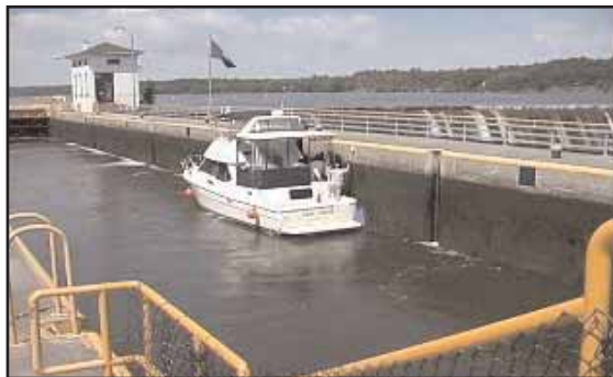
“Mon Cherie” in one of six locks in route to Schenectady Yacht Club