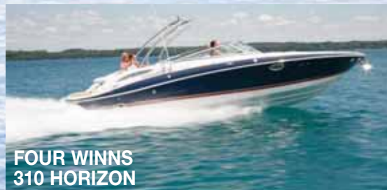
FOUR WINNS 310 HORIZON