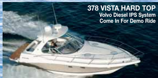
378 VISTA HARD TOP Volvo Diesel IPS System Come In For Demo Ride