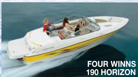
FOUR WINNS 190 HORIZON

PLUS 2.99% FINANCING!! ON ALL VISTA MODELS