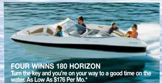
FOUR WINNS 180 HORIZON Turn the key and you're on your way to a good time on the water. As Low As $176 Per Mo.*