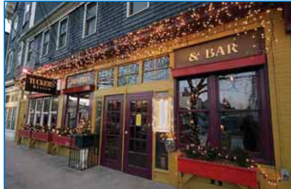
Local favorite "Tucker's Bistro"

Hundreds of booths offer marine electronics, services and accessories, plus educational seminars, Discover Sailing, and a TrawlerPort section for first-time boat and product debuts. Spread over 14 acres along America's Cup Avenue, the show area stretches from the Newport Yachting Center to Newport Harbor Hotel & Marina, including the well-known Bowen's Wharf. The town has one of the highest concentrations of colonial homes in the nation. Many of these homes were restored in the late 20th century through grants made by Newport resident Doris Duke, as well as other local efforts such as Operation Clapboard. As a result, Newport's colonial heritage is well-preserved. In addition, the city is known for its Gilded Age mansions, which have also received extensive restoration from both private owners and non-profits such as the Preservation Society of Newport County.