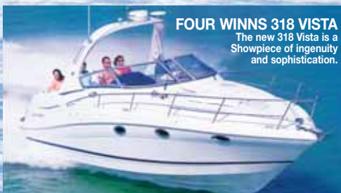
FOUR WINNS 318 VISTA The new 318 Vista is a Showpiece of ingenuity and sophistication.