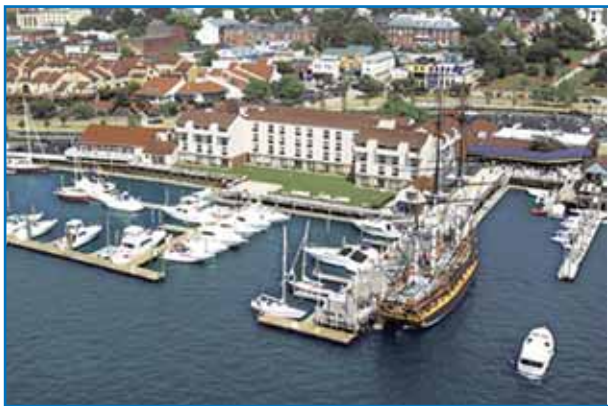
Newport Harbor Hotel & Marina