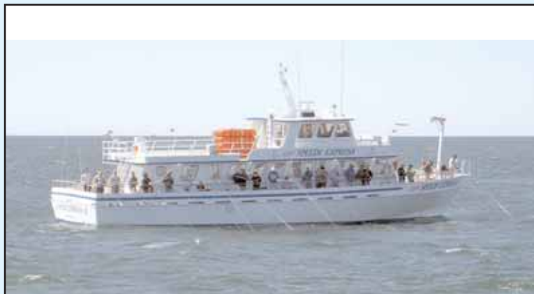
The new super speedy "Express II," Captree State Park.

Bluefishing over structure can result in fish close to 20 pounds, if you target them. The big alligators are cruising off the bottom, picking off any sea bass, fluke or porgy that drops its guard. Take a live bergal and rig it on an egg sinker. Slowly drop it near to the bottom and put the rod in a holder while you fish for whatever else you like. Even chum the surface for the 5- to 8-pound bluefish while the bottom rigs cook for a while. It never fails that a beast will come up on that rig. To the west, diamond jigging from Sheepshead Bay is a blast. Working the Ambrose area down to 17 Fathoms is a mixed bag of blues, stripers, weakfish, bonito, albacore and tuna. Drone spoons, Johnson Sprites and Deadly Dicks work fine on light tackle; just stay small for the bonito and albacore. On the south shore, bait fishing for these torpedoes really is exciting as you watch your bait-caster get smoked. Just use a freshwater rod with something like an Ambassador 6500 and 10- or 15-pound test and a small tuna hook in size 1/0 or smaller. Find clear water near structure and chum with a very thin bunker mix and loads of spearing. Local spearing and large blocks of spearing were in short supply this year. Hopefully, the juveniles