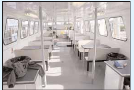
The cabin of the new super speedy "Express II"

Also, watch the regulations, especially the ever-changing tuna regs if you are going offshore and, for that matter, if you hang a tuna inshore remember that you need a tuna license and are subject to the regs.