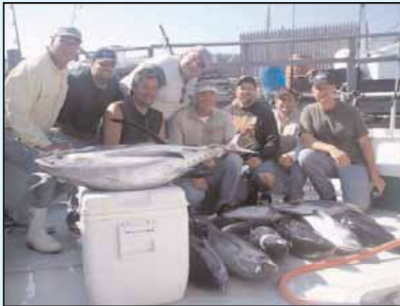
A fine catch of longfin tuna, true albacore, on the "Sea Otter," Montauk.

Watch the weather reports and long-range radar. September is notorious for having trips blown out. Even a storm that doesn't make land-fall can churn up the ocean and make it unfishable. Every day is, possibly, your last chance to fish, so don't waste a good one. One thing to remember - September is traditionally Long Island's best (read worst) shot at having some hurricane damage. Have your storm plan ready to execute at a moment's notice.