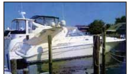
45' SEA RAY SUNDANCER 1998, T/CAT 3126 diesel I/Bs, AP, DF, GPS, radar, Sat TV, stereo, TV/VCR, VHF, AC, hyd. swim pltfm.....$249,995