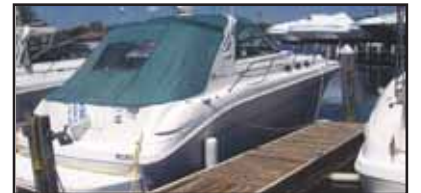
37' SEA RAY SUNDANCER 1997, T/7.4 Merc. I/Bs, AP, DF, GPS, stereo, TV/VCR, VHF, AC, gen, vacuflush head ....$129,995