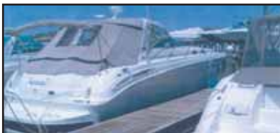
38' SEA RAY SUNDANCER 2002, T/Merc. 8.1S I/B, VHF, DF, stereo, radar, AP, gen, AC, head, central vac ....$209,995