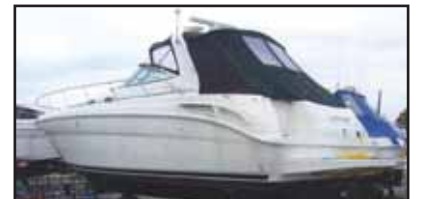
38' SEA RAY SUNDANCER 1999, T/7.4 Merc. I/Bs, AP,DF, GPS, loran, radar, stereo, TV/VCR, VHF, AC, gen, vacuflush head .....