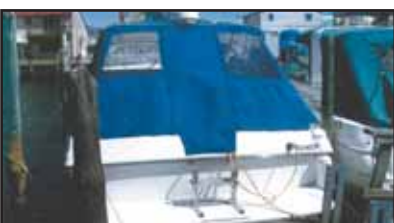
31' CARVER MONTEGO 1991, T/7.4 Volvos, VHF, DF, stereo, loran, radar, gen, refrig/micro, head, sw. pltfm.....$49,995