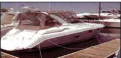
32' REGAL 2004, T/320hp Merc. I/Bs, VHF, stereo, DF, gen, compass, stove, vacuflush head - mac, AC, refrig., swim pltfm.....$134,995