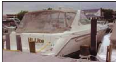
37' MAXUM SCR 2001, T/ 7.4 Merc. MPI, VHF, DF, radar, gen, AC, vacuflush head, TV/VCR, stereo.....$148,995

Also, watch the regulations, especially the ever-changing tuna regs if you are going offshore and, for that matter, if you hang a tuna inshore remember that you need a tuna license and are subject to the regs.