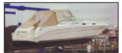
26' SEA RAY SUNDANCER 2001, Merc. 5.7 EFI Bravo III, VHF, DF, stereo, GPS, vacuflush head, stove/micro,refrig., CG pkg.....$49,995

692 S. Wellwood Avenue Lindenhurst, NY 11757