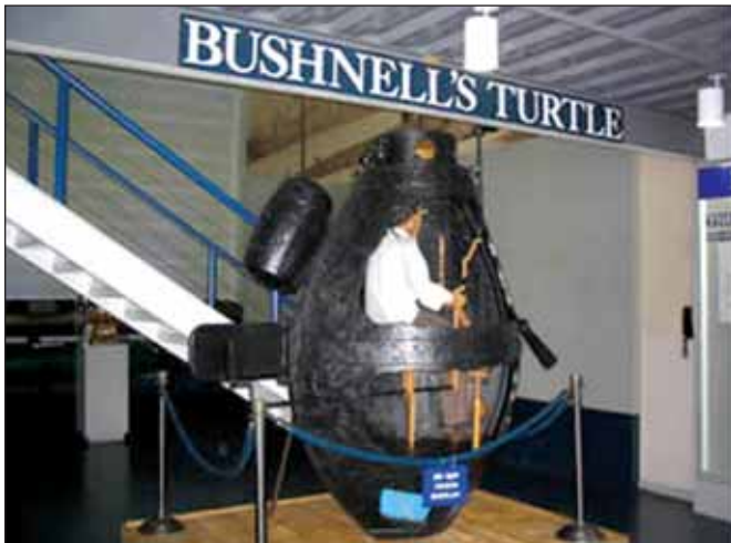
Full Size Model of the Turtle at the U.S. Submarine Museum, Groton CT.

Designed by David Bushnell in 1775, the original Turtle was seven feet long and six feet in diameter. It was constructed of oak and built utilizing iron bands in a similar fashion to barrel construction. The craft was propelled through the water with hand-powered vertical and horizontal propellers. Though limited by the era's lack of machine-driven propulsion equipment, Bushnell's use of ballast tanks that could be pumped was truly a revolutionary idea. This unique use of ballast tanks allowed the operator to take on water ballast to submerge the craft and release a sufficient amount of water to allow the submarine to broach the surface.