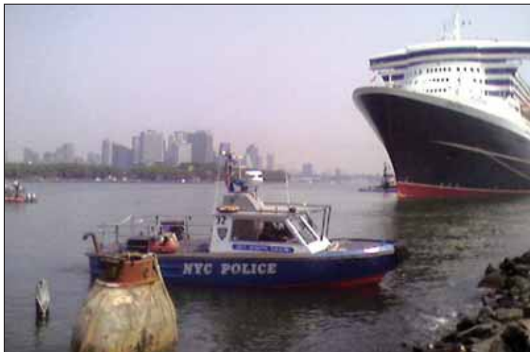
A "Turtle" in hot water.