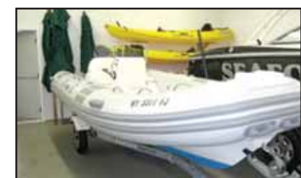
15' Caribe DL-15.....$16,900