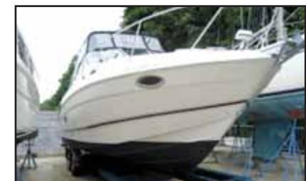
29' Regal 2000.....$64,900