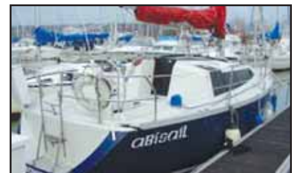
30' O'Day 1988.....$21,900