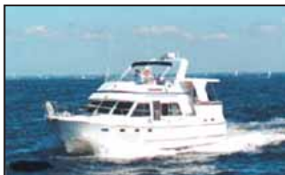
42' Present Sundeck 1984..$159,900

Located at the Britannia Yachting Center