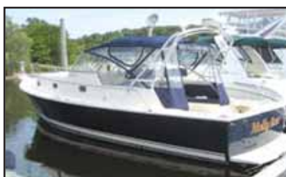
34' Mainship 2005.....$189,900