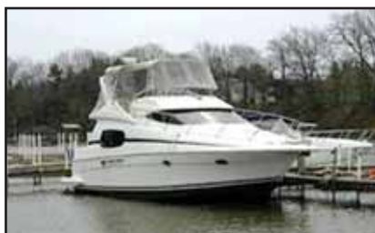
41' Silverton SB 2001..$212,900