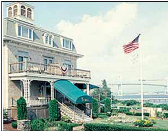
Bay Voyage Inn

being ferried across the bay to its current location on Bryer Point Beach. You can all but pull your kayak up to the reception desk. Once a private home, this Victorian-style inn was built in the mid-1800s and overlooks beautiful Narragansett Bay.