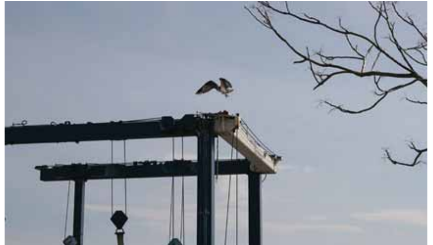
This travel lift is all that remains of a shipyard and restaurant, now for sale, that once occupied the harborfront in New Suffolk. Two ospreys had started a nest on the lift in late April.

From the Sound, take the Mattituck Canal ... just kidding. But I do love firing up that ol' rumor every now and again. Nope, no canal at Mattituck, so it's around Orient Point. Take the north channel between Shelter Island and Greenport, head south-ish once by the Green 11 at Jennings Point on Shelter Island, down past the Red 12 off Paradise Point and