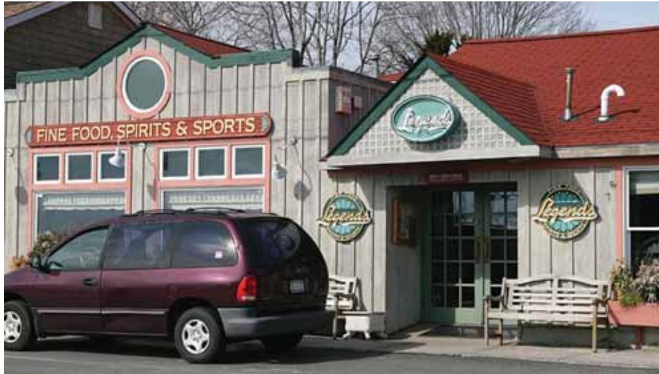
Legends Sports Bar and Restaurant is a boaters' hangout offering some 20 TVs, good food (great burgers), plentiful libations and a place to catch up on the latest seafaring derring-do.

(www.pbsa.net) is based out of Cutchogue, as well, and offers sailors some more structured events, including the five-race New Suffolk Series as well as the sixteenth running of the Whitbread (October 10 this year). This counter-clockwise, around-Shelter Island race takes its name — with tongue firmly in cheek — from the famed Whitbread Race. The latter,