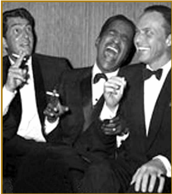
During the 1950s Frank Sinatra, Dean Martin, Sammy Davis, Jr. and many other celebrities, regularly appeared at Atlantic City clubs.

Animal shows were big. You could see a man box a kangaroo, a man dance with a wild tiger while a live orchestra played, or hold your breath as women saddled horses on a high platform then jumped off with them into a pool below. Then there was Rex the Wonder dog, who water-skied and rode AC's waves.