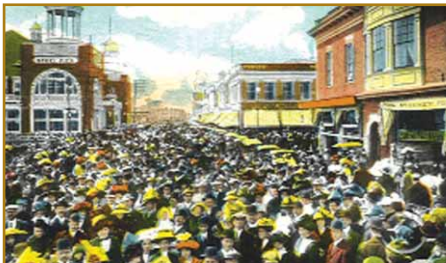
The tradition of the annual Easter Parade on the Atlantic City boardwalk started in 1876. Thousands of people packed the boardwalk to show off the latest fashions, especially hats.

Those looking for entertainment by the sea could find it by watching fishermen trying to capture sea creatures, or the Sea Spider: a tall wooden platform with posts and wheels attached, originally in-