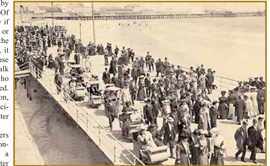
The boardwalk became so popular it had to be widened; still it could hardly handle the crowds.

Thrill seekers could board crazy contraptions such as a wooden roller coaster or Ferris wheel. Or the Haunted Swing, which gave the illusion of throwing passengers upside down and hanging in midair, when in reality it was the room that moved and everything in it such as a picture on a wall or a vase on a table were mounted down.