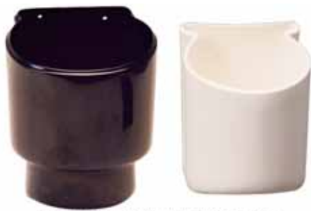
Beckson Marine's HH-61 (left) and HH-6 SoftMate Can Holders

Capable of mounting just about anywhere they are needed, Beckson Marine's SoftMate™ Can Holders keep beverages in place, preventing messy spills. Available in two sizes, they can fit standard canned drinks and cans with insulators, such as koozies.