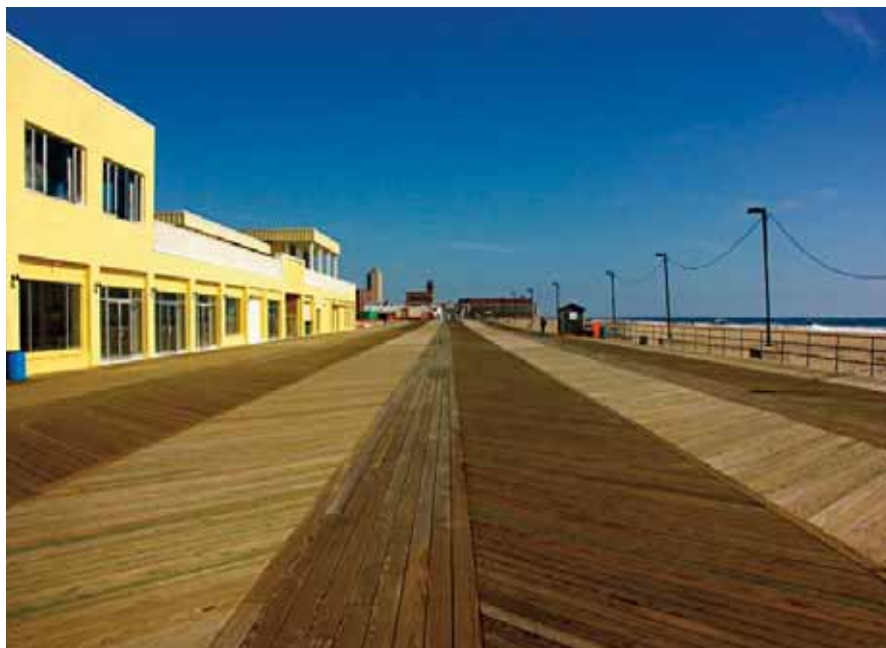
The Boardwalk at Asbury Park.

with pirate crew, learn and sing sea chanteys, hear stories, and search for hidden underwater treasure