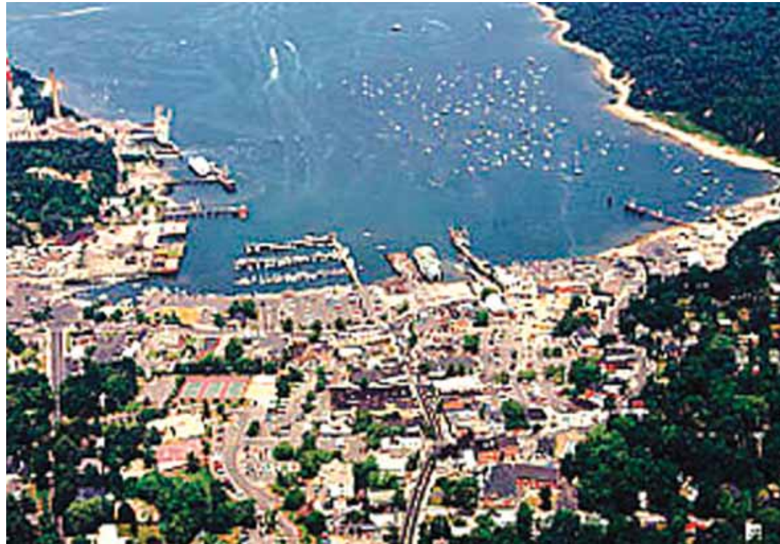
Aerial view of Port Jefferson.

The entire harbor has boats moored everywhere, but