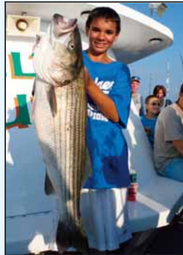
This young gent has a right to be smiling with a cow bass like this one.

Shark baits should be rigged on the way out using rigging needles, floss and some clips or wire pins. Search the Internet for instructions on how to rig baits. Once rigged, and many rigged baits, should be kept on ice. Bluefish will tear up a lot of baits, so be prepared to